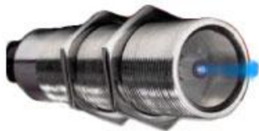
ColorMax color sensor

EMX Industries, Inc has developed the ColorMax color sensor with multi-channel discrete outputs uniquely suited for integration into automated systems. The challenge presented by the small size of the fastener covers was overcome by the use of a 4mm spot size. The ColorMax integrates the signal over the area illuminated by its light source while rejecting the influences of ambient light.